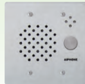
IE-SS Stainless Steel Flush mount