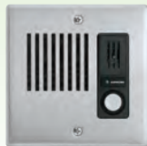
IE-JA Stainless Steel faceplate Flush mount