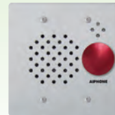
IE-SSR Stainless Steel with red mushroom call button Flush mount