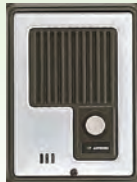
IE-DC Plastic and aluminum cover Surface mount