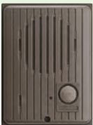
IF-DA Plastic cover Surface mount