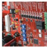
CONTROL BOARD WITH ARRAY OF FEATURES