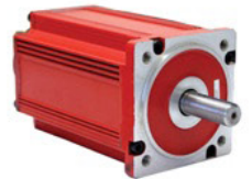
BRUSHLESS DC MOTOR CONTINUOUS DUTY

The Warrantor warrants All SL-100, SL-150, OH-200, SW300 and SW350 Gate Operators. ALL-O-MATIC INC warrants its gate openers for a period of five (5) years in commercial installations, and for a period of seven (7) years in residential installation to be free from defects in circuitry, motor, gear box and workmanship. This warranty applies from the date of purchase to the original owner. Warrantor will repair or, at its option, replace any device which it finds to require service. This device must be sent to the warrantor at the consumer's expense. The warrantor will return the repaired or replaced unit to the customer at the consumer's expense. Labor charges for dealer service or replacement are the responsibility of the owner. These warranties are in lieu of all other warranties either expressed or implied, and ALL-O-MATIC INC shall not be liable for consequential damage. All implied warranties of merchantability and or fitness for a particular purpose are hereby disclaimed and excluded. This limitation is not valid in jurisdictions which do not allow limitation of incidental or consequential damages or limitation of warranty periods. Caution in order to obtain this policy, please complete the registration card and send it by mail within 30 days of purchasing from ALL-O-MATIC INC. or your INSTALLER. If not registered only a one year warranty on all parts will be provided.