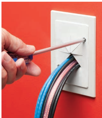
Tighten the two mounting wing screws to pull the CE1RP securely against the wall board.