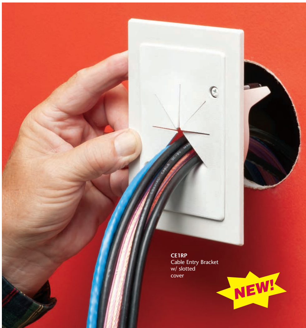
CE1RP Cable Entry Bracket w/ slotted cover

Installs FAST with a hole saw • Non-metallic