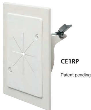
CE1RP Patent pending