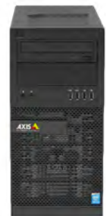
AXIS S9001 Desktop Terminal sold separately