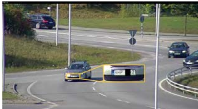
The image to the right is taken with a digital single-lens reflex camera with a 50 mm lens – thus representing the view of the human eye. The image to the left is a snapshot from AXIS Q1765-LE in 18x zoomed-in view where the license plate of a car 275 m (900 ft.) away can be read.