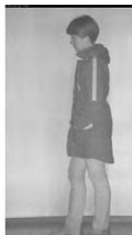
The above images are snapshots from AXIS Q1765-LE mounted indoors in a 30 m (98 ft) long hallway. The image to the left is the camera view in Corridor Format in wide view and day mode at 600 lux. The image in the middle, also in Corridor Format in wide view, is taken in night mode at 0 lux with IR illumination on and shows a person at a 2 m distance from camera. In the image to the right, the AXIS Q1765-LE is in Corridor Format and night mode at 0 lux with IR illumination on. The camera is in full tele view at 18x zoom and the person is at a 30 m.