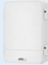
AXIS T98A-VE Surveillance Cabinet Series