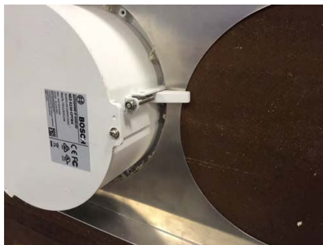
Example installation: in-ceiling AUTODOME IP 5000 HD camera clamped to MNT-ICP-ADC on top of ceiling tile