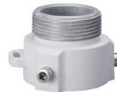
PFA111 Mount Adapter