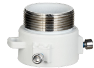
PFA118 Mount Adapter