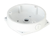
DH-PFA132-E Junction Box