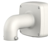
PFB302S Wall Mount