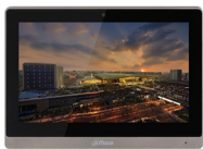
DHI-VTH1660CH 10.2-in. Color Indoor Monitor