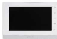
DHI-VTH1550CH 7-in. Color Indoor Monitor