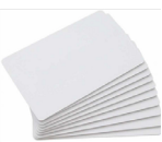
IC-S50 MIFARE® Cards