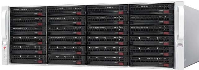
DW-BJE2U DW-BJER2U DW-BJER3U DW-BJER4U (shown)