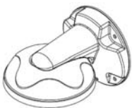
DWC-VFZWM Wall Mount for VF and PTZ5x Models