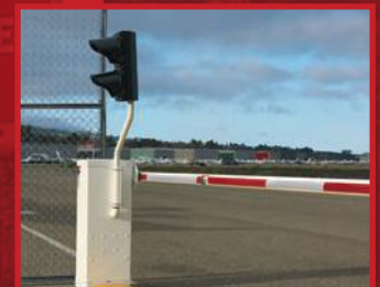
Synchronizes with most vehicular gate and barrier operators