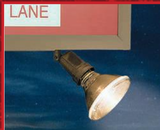
Flood Lamp for spike illumination