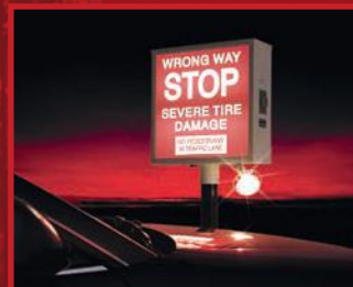
Light Sensor automatically turns sign on at dusk, off at dawn