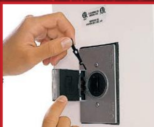
Keyed on/off switch allows sign to be turned on or off manually

GATED COMMUNITIES • PARKING • CONDOMINIUM/ RESIDENT HALL • MIXED USE • COMMERCIAL • SELF STORAGE • MAXIMUM SECURITY