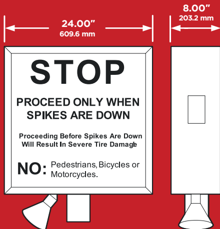
1615-081 Red Both Sides