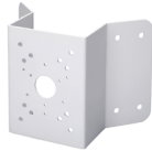
PFA151 Corner Mount