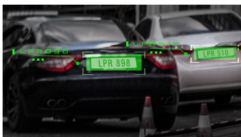
Effective Record Retention