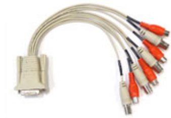
4 cam video cable