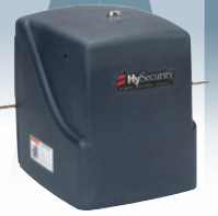
Slide Gate Operator

Ultra Reliable/Low maintenance • Variable speed • Easy, inexpensive installation • Solar