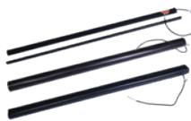
ASO Edge Sensors