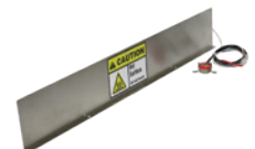
HD25/30 Heater Kit

SYSTEM DESIGN SUPPORT: Contact HySecurity for CAD drawings, tech manuals, help with custom site requirements or other specifications support. Call to speak with a HySecurity representative today.