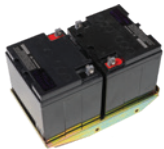
Battery Backup Kit - 50 Ah