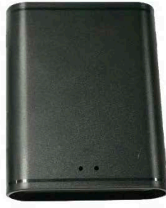
Charcoal Black (Code CB)