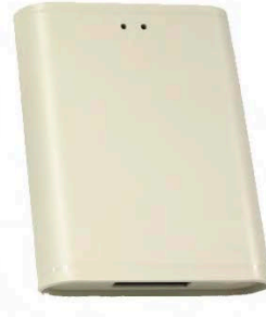
Beige (No Color Code)