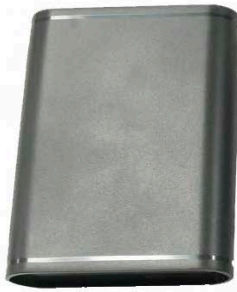
Dark Gray (Code DG)