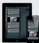
EntraPass Go Mobile App