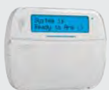
DSC PowerSeries Neo