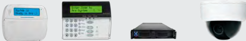
DSC PowerSeries Neo and MAXSYS Alarm Panels