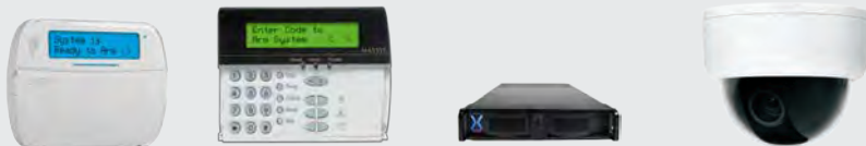
DSC PowerSeries Neo and MAXSYS Alarm Panels