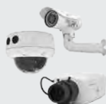
Illustra IP Cameras