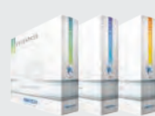
EntraPass Security Software