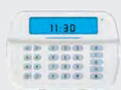
DSC Alarm Panels