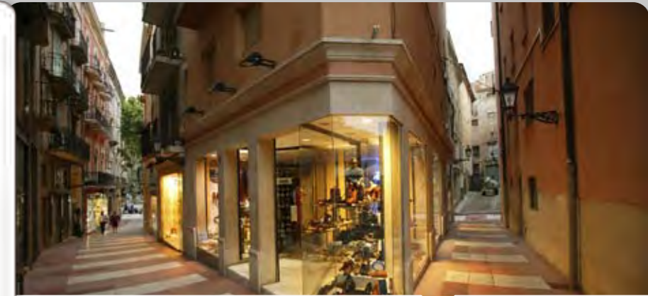
“Advanced authentication solution”

ShadowProx proximity credentials are available in a wide variety of styles suitable for every application. All ShadowProx credentials are encoded with ShadowProx KSF (Kantech Secure Format) and are compatible with all ShadowProx readers.