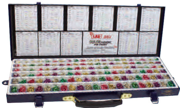
21 1/8" x 7 7/8" x 1 1/8"

The LAB CLASSIC PRO, WEDGE PRO, SUPER WEDGE & SMART WEDGE PINNING KITS... feature exclusive designs that can only be found on LAB PINNING KITS - U.S. PATENT number: 5,482,159.