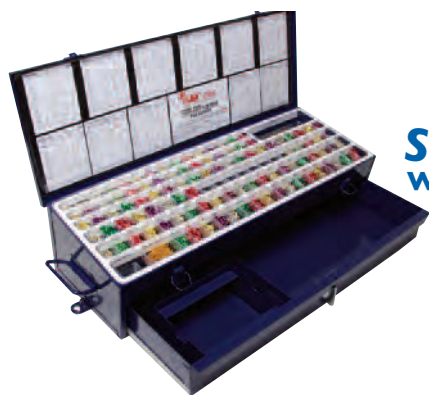
21 1/8" x 8 1/2" x 4 1/2" F x 5 3/4" B Internal Drawer Storage 12 1/2" x 7" x 2 5/16"