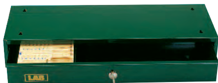
Size: 21 1/8" x 7 3/4" x 3 1/8" Internal Drawer Storage 12 1/2" x 7" x 2 5/16"