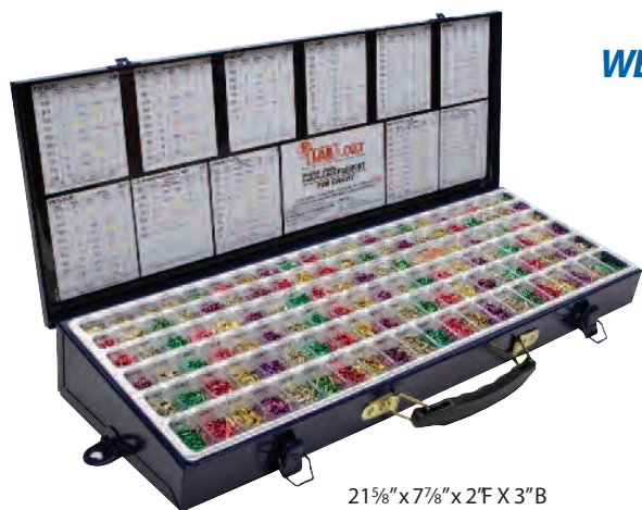
21 5/8" x 7 7/8" x 2" F x 3" B