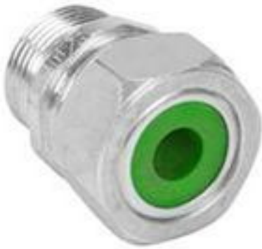
Cord Grip (to use with EYM) to seal off wiring connections to explosion proof lights

Please see last page for supporting documentation for this product(certificates, CAD files & drawings, IES files, wiring diagrams, etc).