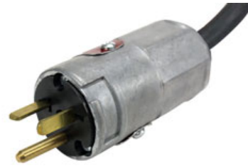
5-15 Straight Blade Plug