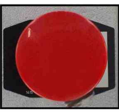
MUSHROOM PUSH BUTTON