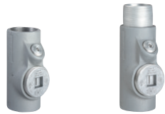
(For Horizontal Conduit)