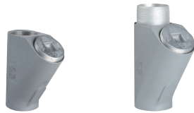
(For Vertical Conduit)