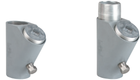
(Drain/Seal for Vertical Conduit)