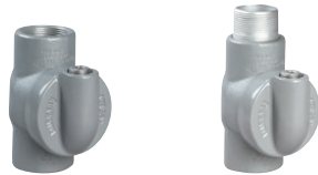
(For Vertical or Horizontal Conduit)