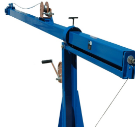
Click Image to Enlarge