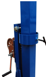
Click Image to Enlarge