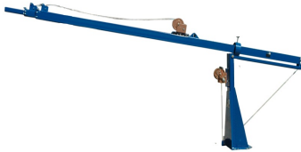
Click Image to Enlarge