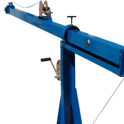
Click Image to Enlarge