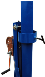
Click Image to Enlarge