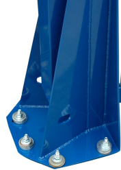
Click Image to Enlarge