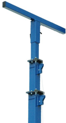
Click Image to Enlarge

middle section 10 feet in length and 3.5 inches in diameter, and an upper section 7 feet in length and 3 inches in diameter. Each section has 2 foot of overlap. The mast is elevated using an included 1,000 lbs hand winch with 3/16 inch cable and extended to its full height using a second 1,000 lbs winch.