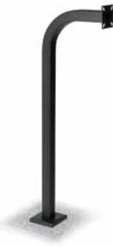
Product No. ACP00906