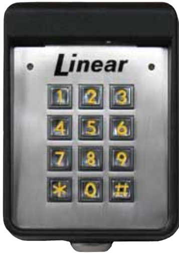
Product No. ACP00520

The Model AM-KP keypad is housed in a rugged cast aluminum enclosure. The die-cast keys have bright, easy-to-read yellow graphics. Each key has a positive tactile click feel when pressed. An incandescent panel lamp lights the keypad for nighttime use. Red, green and yellow indicators show power, access and lockout conditions