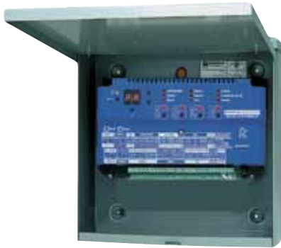
Product No. ACP00913

The CAB-3 is a NEMA 3R rated metal cabinet for housing the AP-5 or AM3Plus. It is for use in outdoor applications.