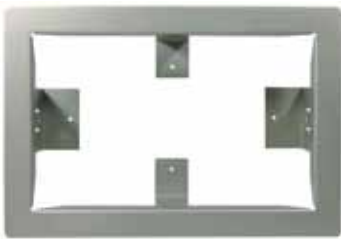
Product No. ACP00915

The TR-RE2N is for recess mounting a Model RE-2N Residential Telephone Entry System. The flush-mount trim ring attaches to the wall studs or custom framing. The RE-2N attaches to the mounting ring.