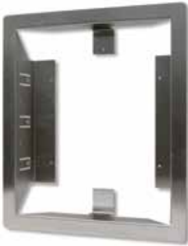
Product No. ACP00908