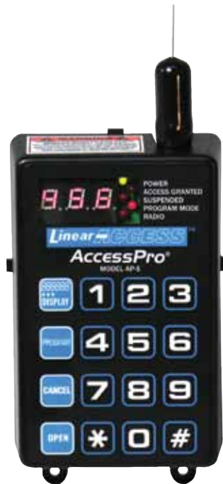
Product No. ACP00953

Wireless Access Controller Two Gates or Doors