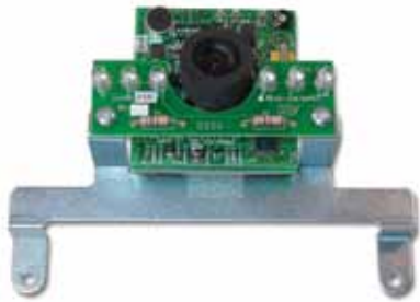
Product No. ACP00886A

The Model RE-BWC1 Black & White Camera mounts inside Linear's RE-1 residential telephone entry system and provides black and white video of the entry system visitor. Built-in infrared illuminators help to light the subject in low-light conditions.