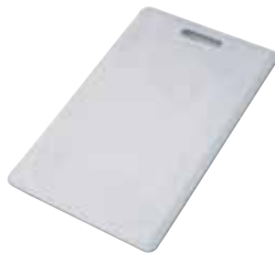
Product No. ACP00739