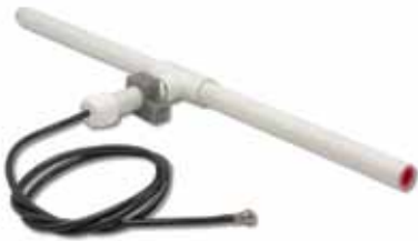
Product No. AAE00331

The EXA-2000 can be connected to the F connector on many Linear receivers to improve their range in a specific direction when they must be located in poor signal reception locations.