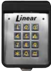
Product No. ACP00748

Airports, hospitals, warehouses, office buildings, parking lots, and many other commercial facilities