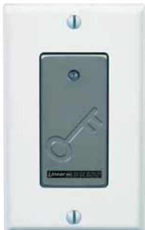
Product No. ACP00560

The AM-RPR Remote Proximity Receiver is for use with Linear's access control systems. It functions as a remote device that supplies localized radio reception.