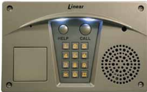
RE-2N Product No. ACP00910