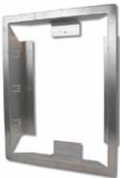
Product No. ACP00909