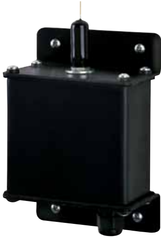
Product No. ACP00727