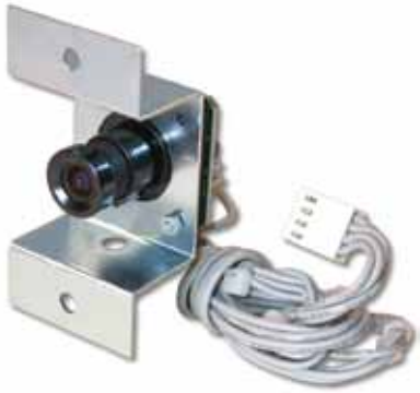
Product No. ACP00904A

The Model CCM-1A Color Camera mounts inside Linear's commercial access controllers. The camera provides color day/night camera captures images with great detail in not only well-lit environments, but also in low-light conditions. In daytime, the CCM-1A will provide a full-color image and a black-and-white image in low light periods, such as dusk and dawn.