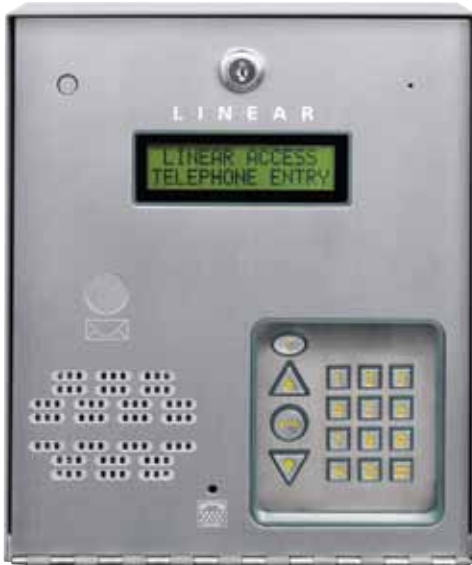
Product No. ACP00937