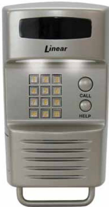
RE-1N Product No. ACP00892 RE-1SS Product No. ACP00896 (Not Shown)

The stylish RE-1 is designed for residential or light commercial access control. The speakerphone, keypad, radio receiver, and optional video camera are housed in a rugged enclosure that can be mounted to a pedestal or bolted directly to a wall. The die-cast keypad keys have bright, easy-to-read graphics and are lit with an overhead light. The two operation buttons; CALL and HELP, are machined for heavy-duty reliability