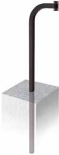
Product No. ACP00907