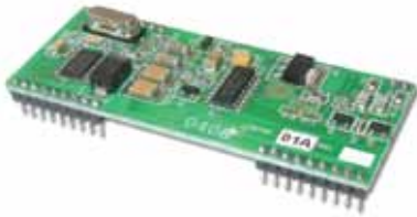
ACM-1 Replacement Modem Product No. ACP00905