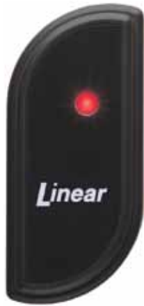
Product No. ACP00740