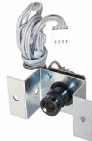
Product No. ACP00936A

The Model CCM-2A Color Camera mounts inside Linear's RE-2 telephone entry system. The camera provides color day/night camera captures images with great detail in not only well-lit environments, but also in low-light conditions. In daytime, the CCM-2A will provide a full-color image and a black-and-white image in low light periods, such as dusk and dawn.