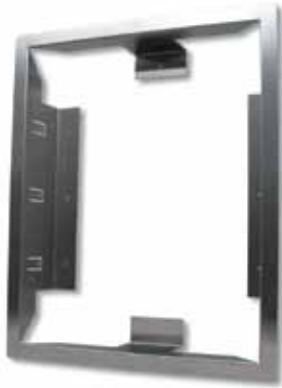
Product No. ACP00914

The TR-2000 is for recess mounting the Model AE2000Plus Commercial Telephone Entry System with Access Control. The flush-mount trim ring attaches to the wall studs or custom framing. The AE2000Plus attaches to the mounting ring.