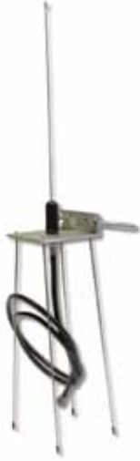
Product No. AAE00198

The EXA-1000 can be connected to the F connector on many Linear receivers to improve their range when they must be located in poor signal reception locations.