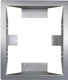
Product No. ACP00941