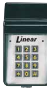
Product No. ACP00878