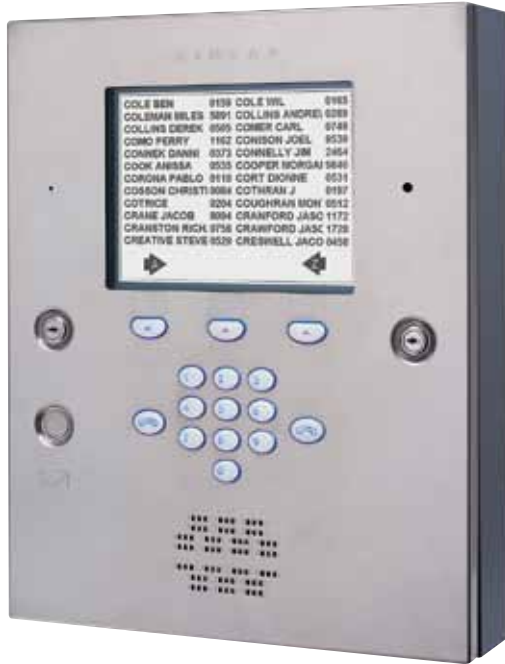
Product No. ACP00952

Commercial Telephone Entry System with Access Control Four Gates/Doors, Large Screen