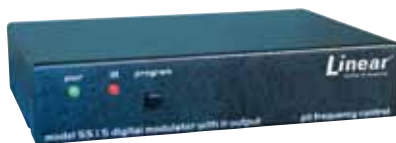
Product No. AAE00436

This digital modulator converts any baseband NTSC video and audio signal to a selected UHF or Ultraband CATV channel. A quartz crystal reference oscillator and PLL circuitry ensure drift-free performance. The modulator can be used to convert video signals from Linear's access control systems to UHF or CATV signals that can be viewed on a standard television set at the installation.