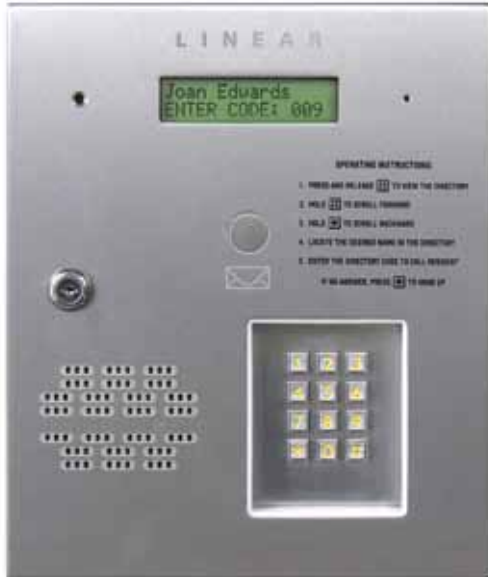
Product No. ACP00899

Commercial Telephone Entry System Two Gates/Doors