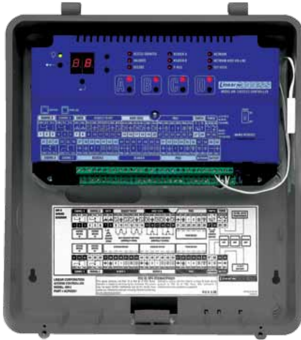
Product No. ACP00950