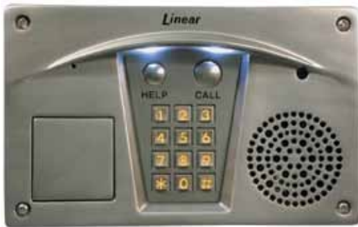
RE-2SS Product No. ACP00919