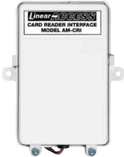
Product No. ACP00717

The AM-CRI is a card reader that will support one or two 26-bit, 30-bit, or 31-bit Wiegand input devices. If the readers used have a hold or buffer connection, two readers may be used to the AM-CRI. If the readers do not have a hold or buffer connection, one reader may be used with the AM-CRI. Usually mounted near the readers, the AM-CRI interface connects to the control unit through a PBUS cable. Each reader connects to the AM-CRI through a six-wire (one LED in reader) or seven-wire (two LEDs in reader) cable.