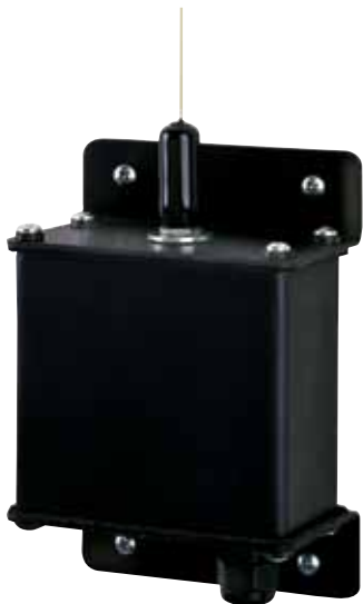
Product No. ACP00500