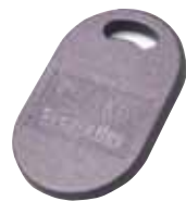
Product No. ACP00742