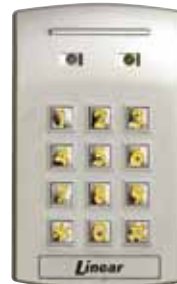
Product No. ACP00751

The AK-21 is housed in a rugged, plastic enclosure for mounting in a standard single-gang electrical box. It is supplied with four different plastic snap-on mounting bezels to customize the look of the keypad. The satin-chrome bezel comes factory installed on the keypad. The white, ivory, and bronze bezels are packaged separately. All system indicators and lights are long-lasting, solid-state LEDs. An internal sounder beeps when each key is pressed.