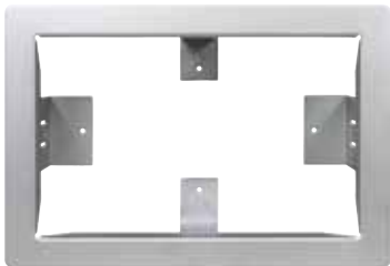
Product No. ACP00917

The TR-RE2SS is for recess mounting a RE-2SS Residential Telephone Entry System. The flush-mount trim ring attaches to the wall studs or custom framing. The RE-2SS attaches to the mounting ring.