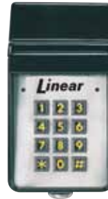
Product No. ACP00747