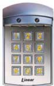
Product No. ACP00750

The AKR-1 features an integral radio receiver for versatile access control functions. This exterior digital keypad is housed in a rugged cast aluminum enclosure that can be mounted to a pedestal or bolted directly to a wall. Linear's Model MGT safety edge transmitter is compatible with the AKR-1 and can be used to detect and transmit obstacle events to the receiver and activate Relay #2.