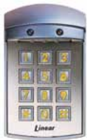
Product No. ACP00749

Airports, hospitals, warehouses, office buildings, parking lots, and many other commercial facilities