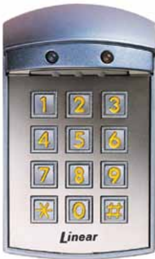
Product No. ACP00887

The Model AM-KPI Interior Keypad is housed in a rugged, plastic enclosure and is designed to be mounted indoors in a standard single-gang electrical box. The keypad is supplied with a satin-chrome plastic bezel installed. Three interchangeable colored plastic bezels (white, ivory, & bronze) are included with the unit to customize the keypad appearance for the installation.