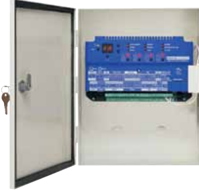
Product No. ACP00420

The CAB-1 is a metal cabinet for housing the AM3Plus. It is for use in indoor applications.