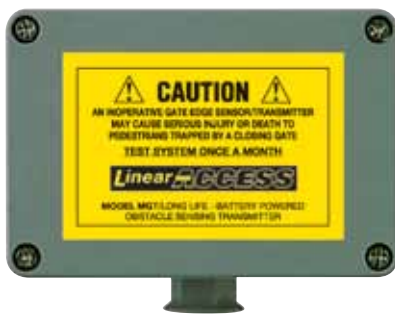
Product No. DNT00068

The MGT adds fully supervised obstacle sensing for motorized gates, doors, or barrier arms in any Linear access control system or APeX Controller equipped gate operators. It mounts directly on the gate, door, or barrier and wires to a standard exterior safety edge sensor.