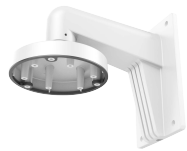
LTB342-140 Wall Mount Bracket