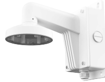
LTB342-140B Wall Mount with Junction Box