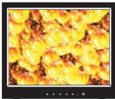
Before 3D Motion Adaptive De-interlacer

In signal processing, a motion adaptive adds a delayed version of a signal to itself, causing constructive and destructive interference. The frequency response of a motion adaptive de-interlacing consists of a series of regularly-spaced spikes, giving the appearance of a comb.