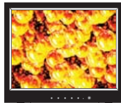
After 3D Motion Adaptive De-interlacer