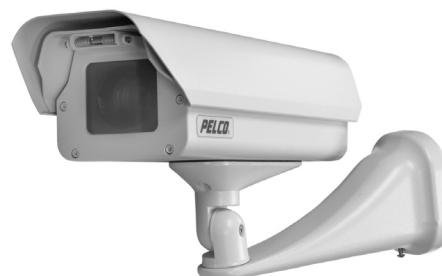
EH3512 ENCLOSURE WITH SUN SHROUD AND EM3512 MOUNT

The EH3512/EH3515 Series are indoor/outdoor, low cost camera enclosures constructed from die-cast and extruded aluminum. The EH3512 has a lower body length of 32.38 cm (12.75 inches) and the EH3515 has a lower body length of 40.00 cm (15.75 inches).