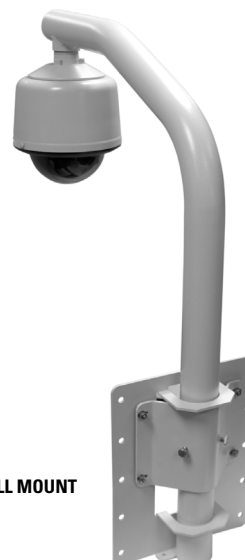
PP350 PARAPET WALL MOUNT

The PP350 and PP351 mounts were designed for outdoor use with small-size pendant domes (such as Spectra and DF5 Series), and the PP450 and PP451 are for outdoor use with medium-size pendant domes (such as DF8 Series). The PP350 and PP450 models mount to parapets, while the PP351 and PP451 models mount to rooftops or other smooth horizontal surfaces. All models accommodate domes that use 1.5-inch NPT pipe.