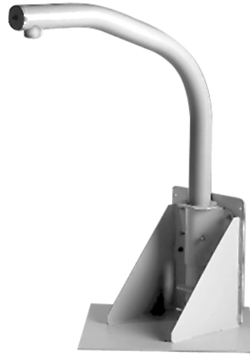
PP351 PARAPET ROOFTOP MOUNT