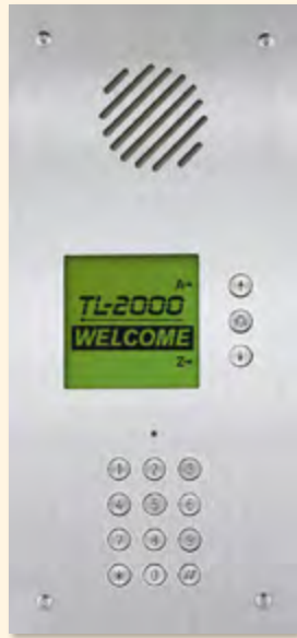
TL-2000 Audio Telephone Entrance Station • Stainless steel panel • Weather and vandal resistant • Flush mount (back box included) → p. 103