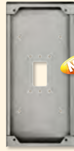
SBX-TL2000 Surface Mount Box for TL-2000 → p. 103