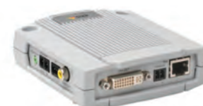
Simple monitoring solution for Axis network products.

In situations where only live video display is required – such as with a public view monitor at a store entrance, AXIS P7701 offers a more cost-effective solution than connecting a monitor to the network via a PC. AXIS P7701 can also complement a video management system by helping to offload the main server from decoding digital streams simply for display purposes.