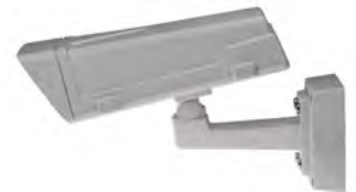
With AXIS T94R01P Conduit Back Box

AXIS T93F Series comes with a wall mount and an integrated sun cap. AXIS T94R01P Conduit Back Box, and AXIS Corridor Format Brackets are available as optional accessories to increase installation flexibility.