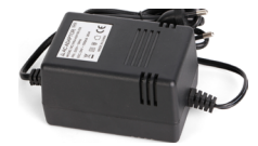
AC24V/1.5A Power Supply