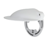
PFA200W Sun/Rain Shield