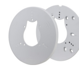
PFA200G Gang Box Adapter