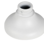
PFA106 Mount Adapter