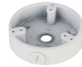
PFA137 Junction Box