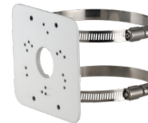
PFA152-E Pole Mount