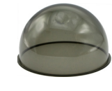
PC-H49-D90 Polycarbonate Smoke Tinted Bubble