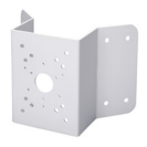
PFA151 Corner Mount