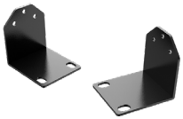
DW-G419RE 19" rack mount ears