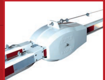
Wishbone Style Aluminum arms up to 27 feet in length