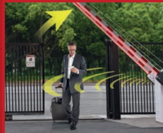
DKS Pedestrian Protection System it's aware - even when they're not