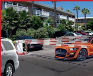
Automatic P.A.M.S. sequencing with slide and swing gates