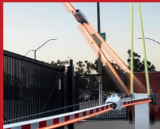
Octagonal Lighted Signal Arm Option light the way for customers to exit easily and safely with signals and sensors