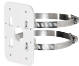
PFA152 Pole mount