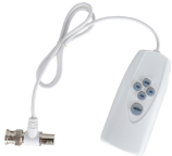
PFM820 UTC Controller