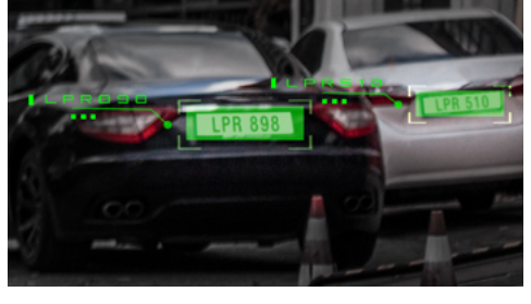
Effective Record Retention