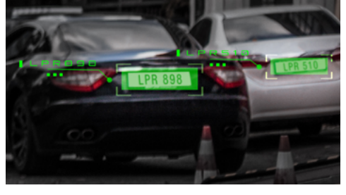
Effective Record Retention