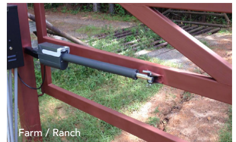
Farm / Ranch

SYSTEM DESIGN SUPPORT: Contact Nice/HySecurity for help with custom site requirements, CAD drawings, tech manuals or other specifications support.