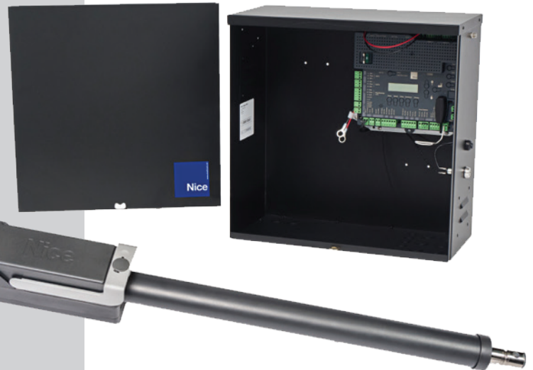
TITAN12L1 : 1050 Board, CBOX, 912L actuator

* Battery required for operation, not included