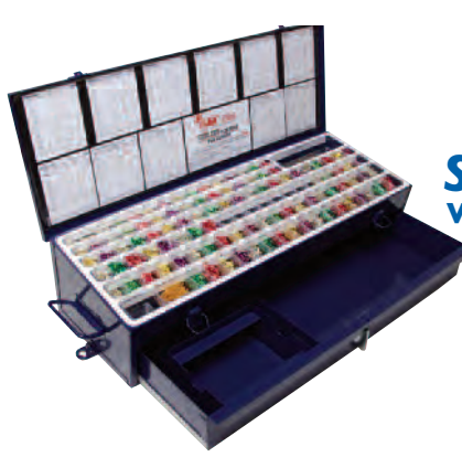
21%"x 81/2"x 41/2Fx 53/4"B Internal Drawer Storage 12 1/2" x 7" x 25/15"