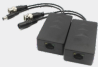
PFM801-4MP Passive HD-over-Coax Balun with Power