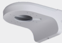
PFB204W Wall Mount