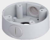
PFA13A Junction Box