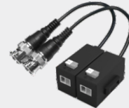
PFM800-E Passive HD-over-Coax Balun